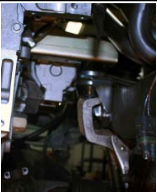
Clamp the frame bracket to the frame rail to check clearance before welding mounts into position.

The mount can be assembled with the rubber mounts on the inner slot for a narrow frame or the outer slots for a widerframe. When the engine location is selected, tighten the carriage bolt to secures the mount location and then weld two 1/2" or more beads to secure the slide lock tab.